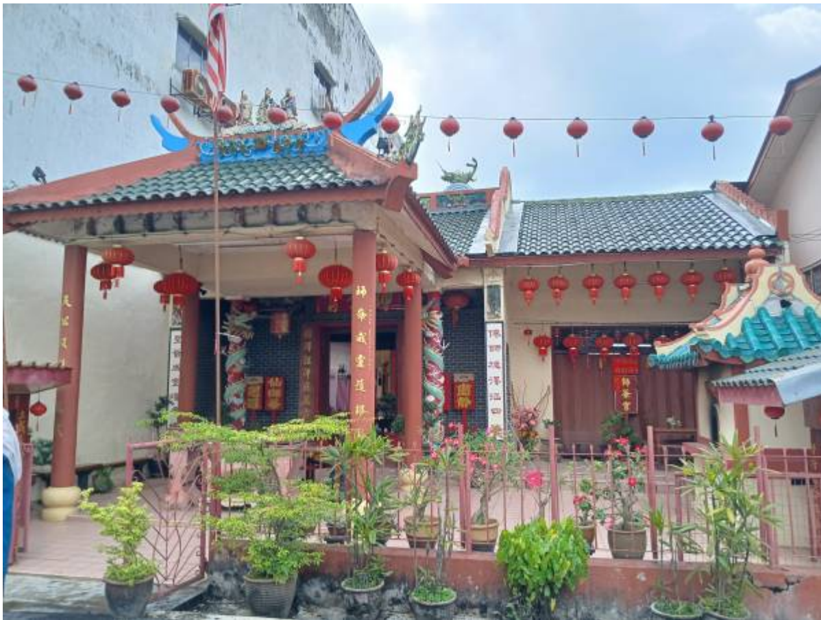
Kiri: Tokong Shen Sze She Yar (TMK Pulasan, 2025).