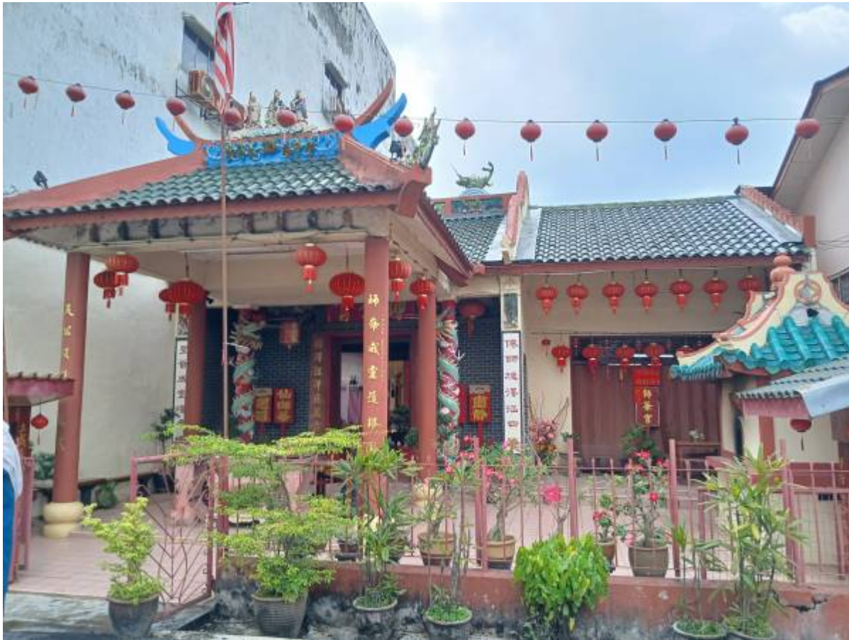
Kiri: Tokong Shen Sze She Yar.