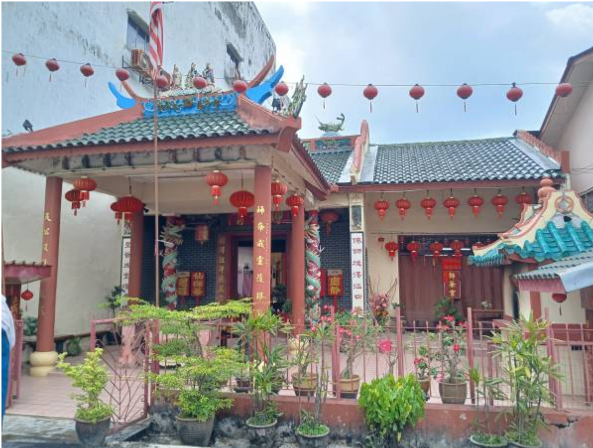
Kiri: Tokong Shen Sze She Yar (TMK Pulasan, 2025).