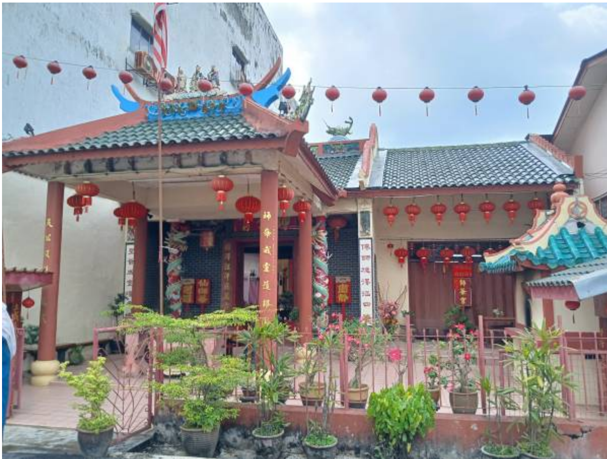
Kiri: Tokong Shen Sze She Yar, Kajang.