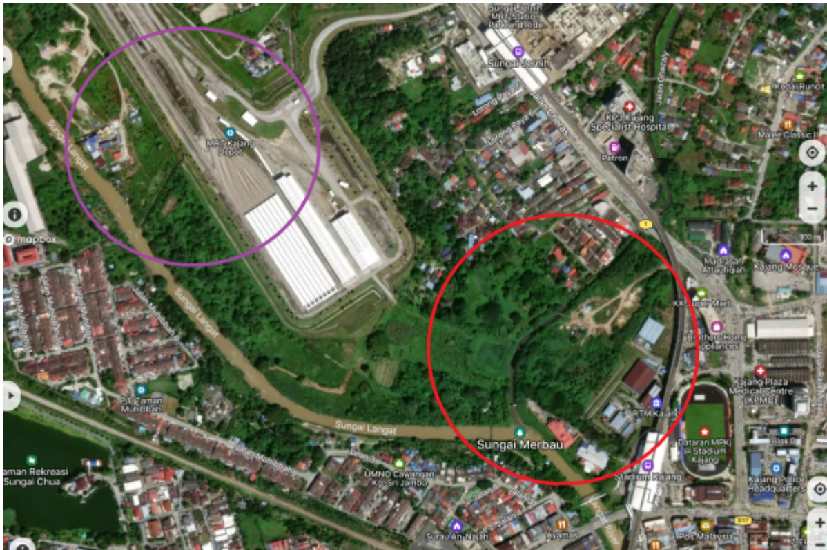
Gambar satelit 2026 (jarak dekat) (Mapcarta, 2026).