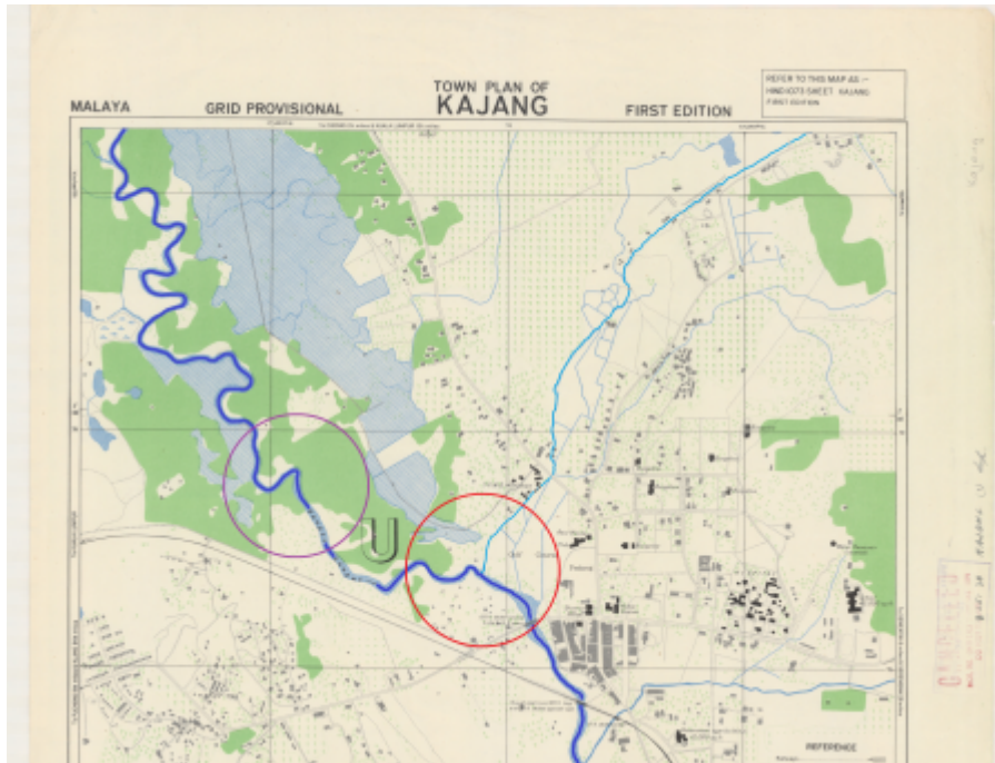
Kiri: Peta 1904. Kanan: Peta 1945