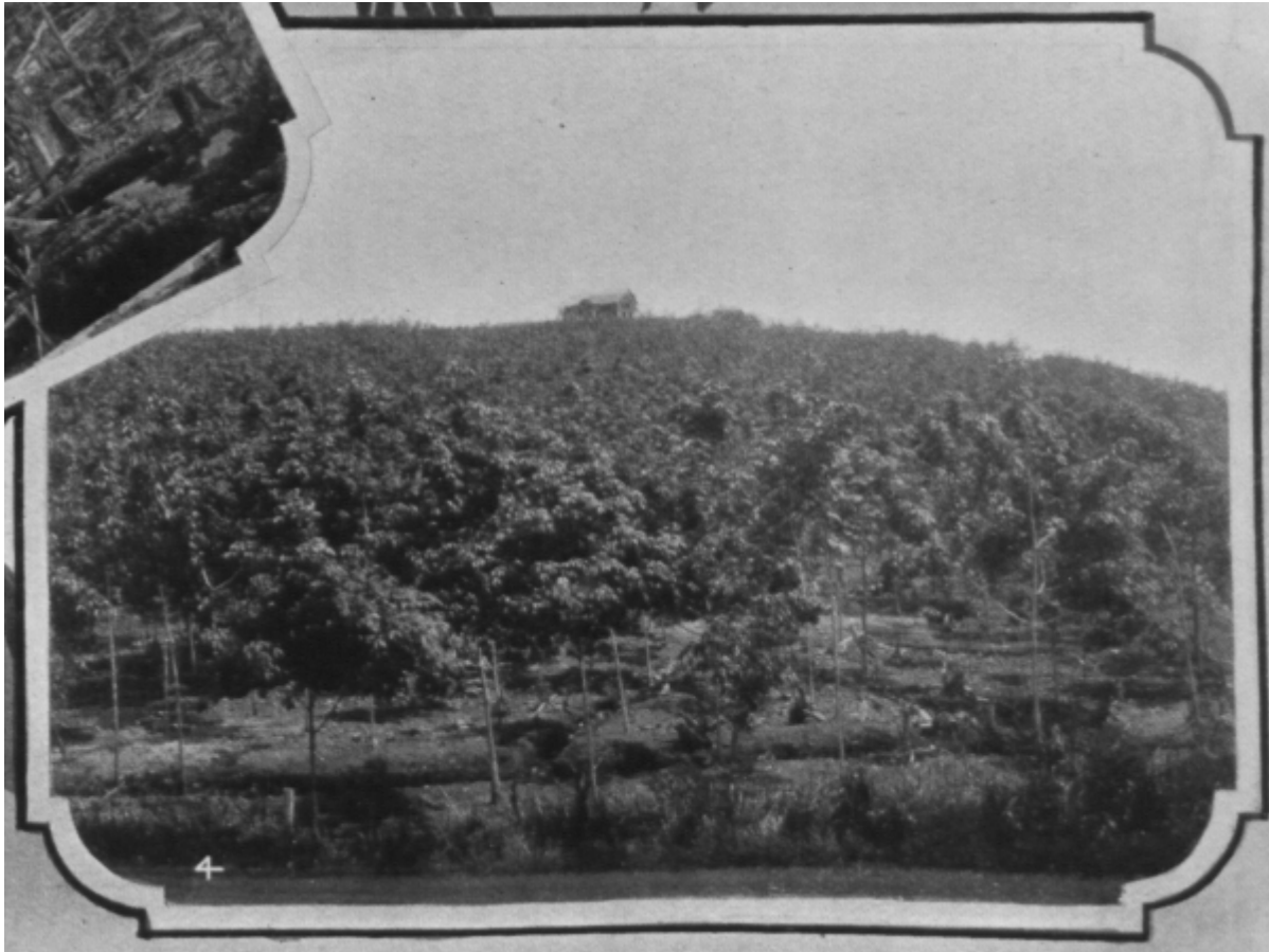
Gambar Reko Hill Estate sekitar 1908. Sayup kelihatan di puncak bukit, kemungkinan banglo Kindersley: "The Inch Kenneth Rubber Estates, Ltd. .... 4. View of Reko Hill Estate." (Arnold Wright, 1908: "Twentieth century impressions of British Malaya: its history, people, commerce, industries, and resources", m.s. 456).