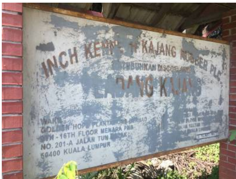
"Inch Kenneth Estate sign near Kajang."