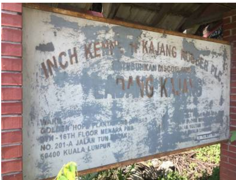
"Inch Kenneth Estate sign near Kajang."