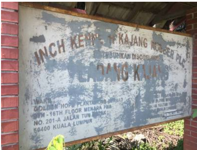
"Inch Kenneth Estate sign near Kajang."