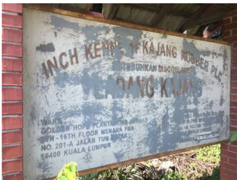
“Inch Kenneth Estate sign near Kajang.”