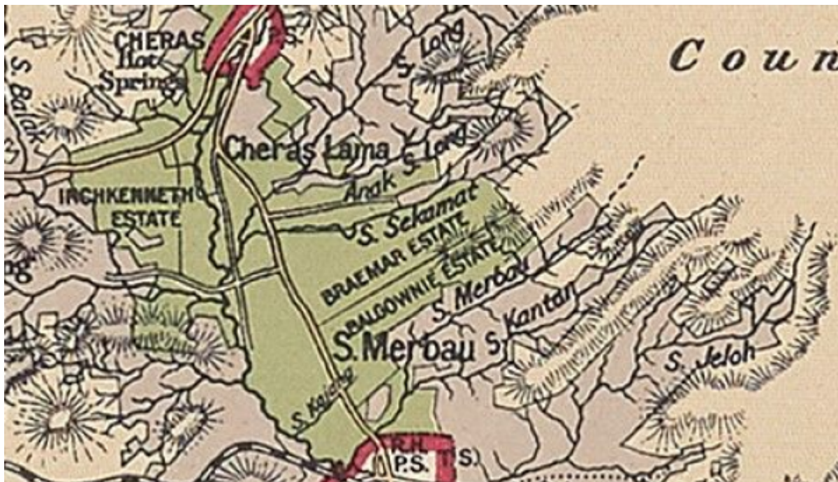
Peta Braemar Estate, 1904 (Edinburgh Geographical Institute, 1904 @ Yale University Library - Digital Collections: