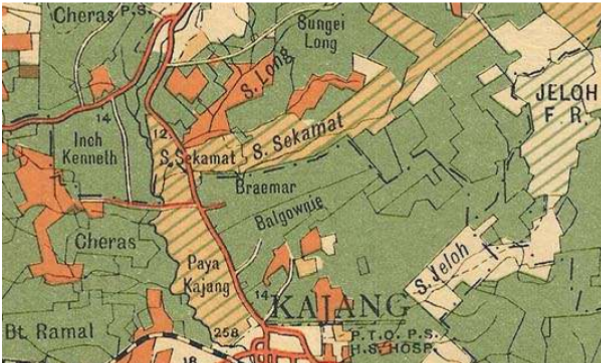
Peta Braemar Estate, 1929 (Edward Stanford @ F.M.S. Survey Department, 1929:

"1929 F.M.S. Wall Map of Selangor (Kuala Lumpur)").