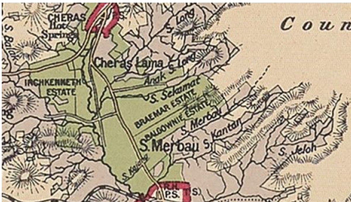
Peta Braemar Estate, 1904 (Edinburgh Geographical Institute, 1904 @ Yale University Library - Digital Collections: