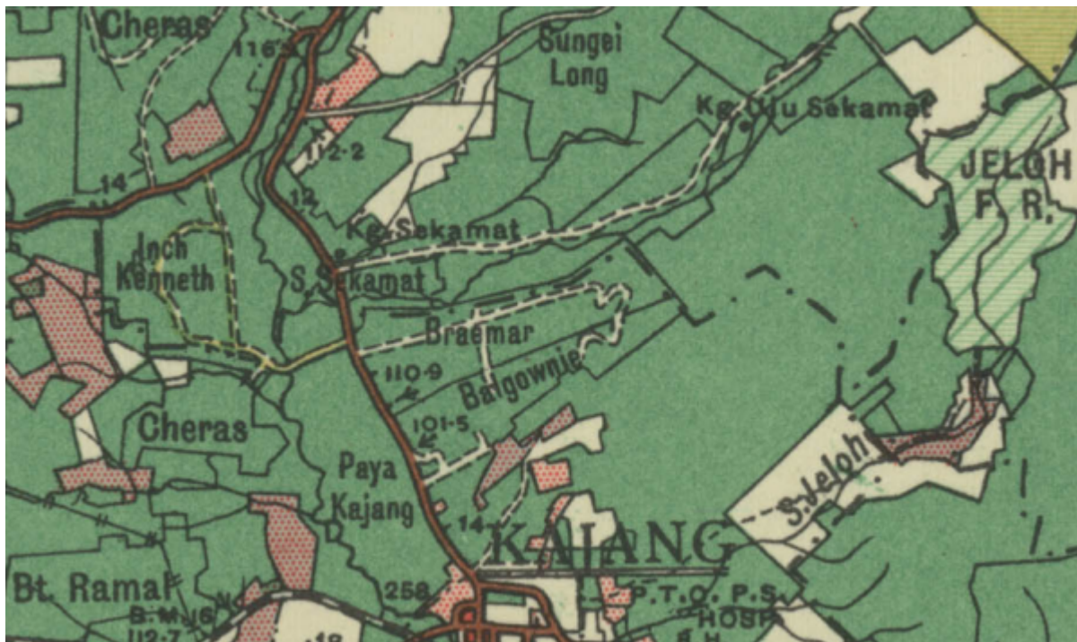
Peta Braemar Estate, 1950 (Surveyor General, Malaya, 1950 @ Australian National University:

"Malaysia, Malaya, Selangor 1950, Land Use, South Sheet, 1950, 1:126 720") .