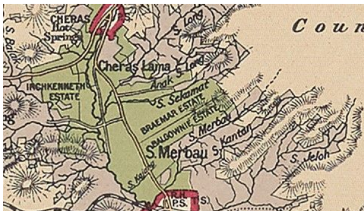
Peta Braemar Estate, 1904 (Edinburgh Geographical Institute, 1904 @ Yale University Library - Digital Collections: