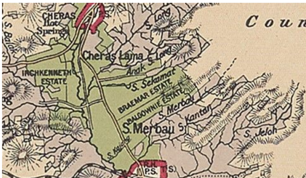
Peta Braemar Estate, 1904