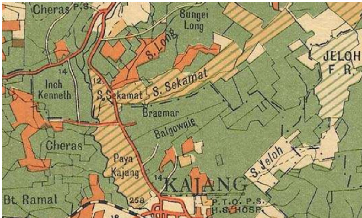
Peta Braemar Estate, 1929 (Edward Stanford @ F.M.S. Survey Department, 1929:

"1929 F.M.S. Wall Map of Selangor (Kuala Lumpur)".