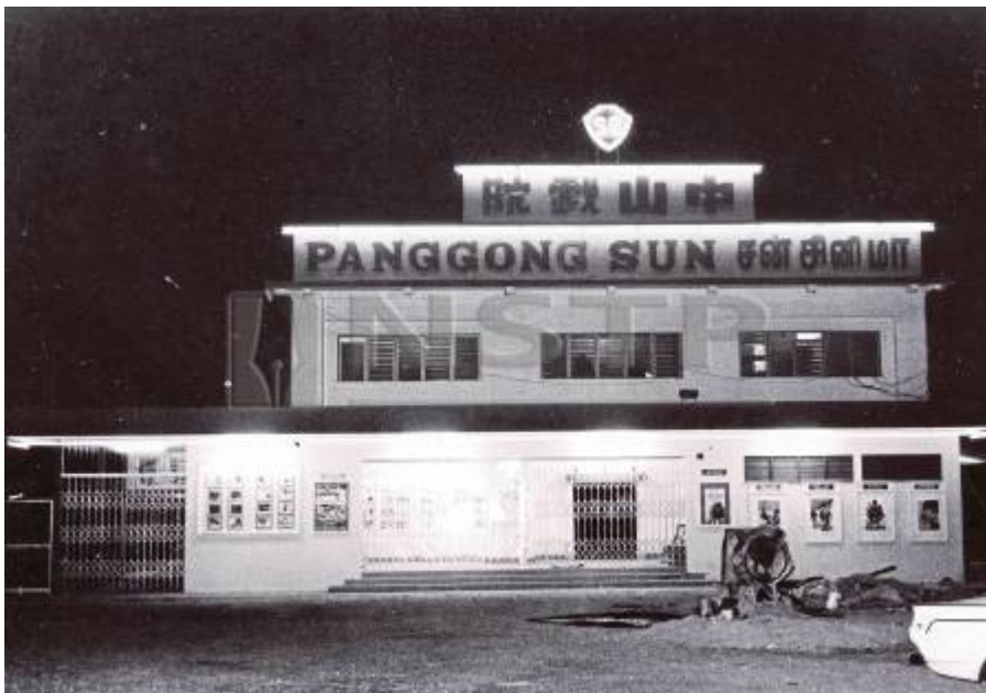
Panggong Sun, lokasi kongres ini (Gambar tahun 1969): "Alas, the sun has gone down. NSTP PIC (1969)"