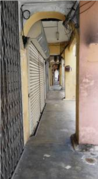
“While walking back to Kajang Heritage Centre from Kedai Buku MakAli, took a photo of the narrow five-foot way linking old shophouses along Jalan Tengah. The row of relatively smaller shops are supposed to be the earliest brick shophouses in Kajang Town. History record says that the first batch