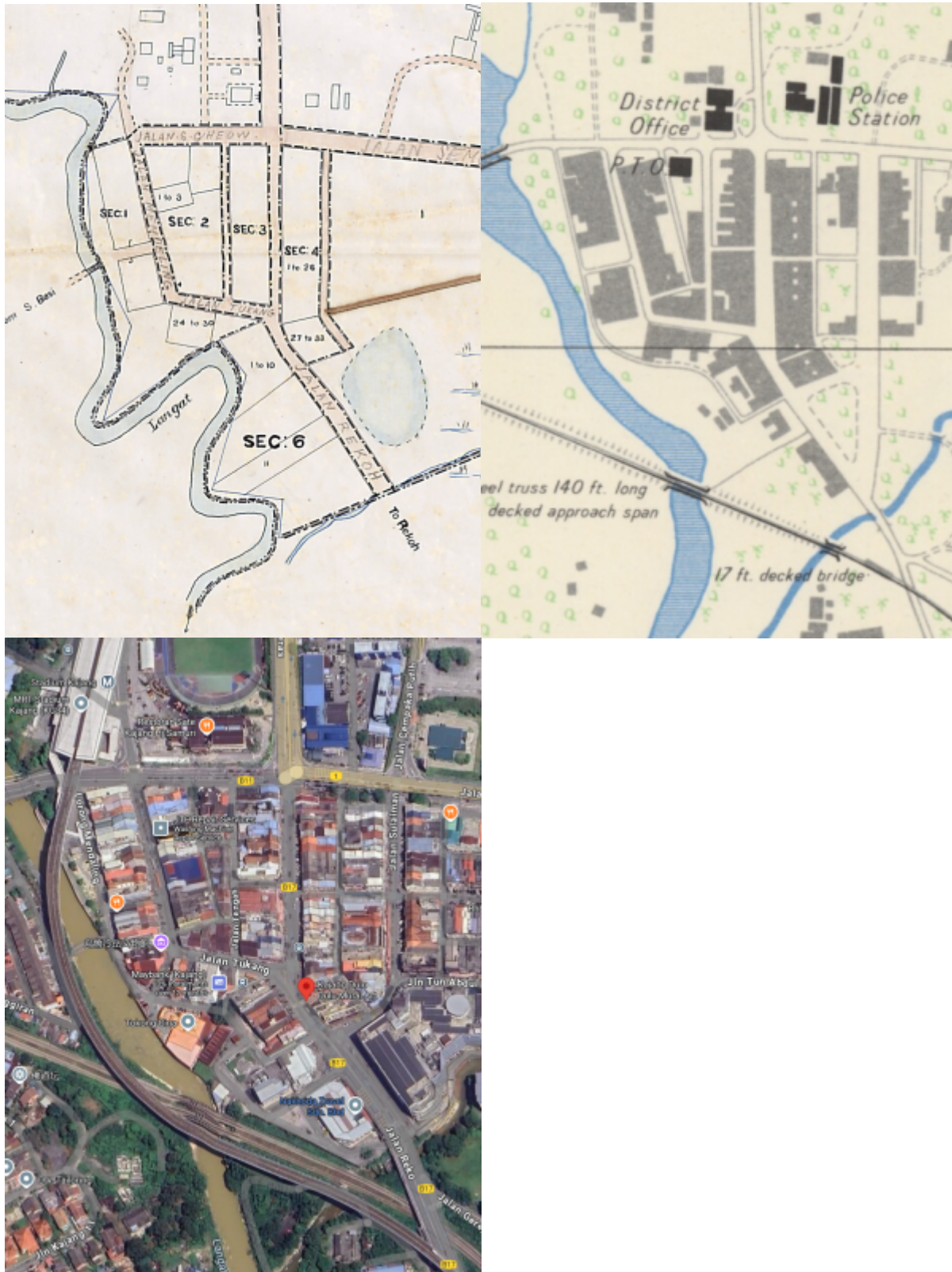
Kiri: Peta pekan Kajang tahun 1896 (Arkib Negara 1957/0062295W, 12/03/1896:

"NAMING OF STREETS ETC IN TOWNS OF CHERAS KAJANG AND SEMENYIH": "A closeup of 1896 map of Kajang Town. British Colonial Government then did some segmentation of the town from section 1-section 9. Early development concentrated in Section 1-4 along Jalan Mendiling, Jalan Tukang, and