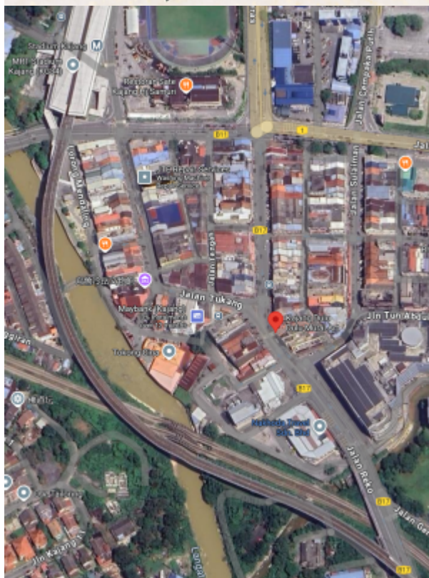
Kiri: Peta pekan Kajang tahun 1896 (Arkib Negara 1957/0062295W, 12/03/1896:

| "NAMING OF STREETS ETC IN TOWNS OF CHERAS KAJANG AND SEMENYIH"): "A closeup of 1896 map of Kajang Town. British Colonial Government then did some segmentation of the town from section 1-section 9. Early development concentrated in Section 1-4 along Jalan Mendeling, Jalan Tukang, and later extended to Jalan Besar(Main Street) and Jalan Tengah(Middle Street). The present Metro Plaza site was a tin mine by Towkay Chow Yoke who owned the row of shop houses along Main Street. If you notice a bridge over Langkat River, it was not at present site. The wooden bridge link from Lorong